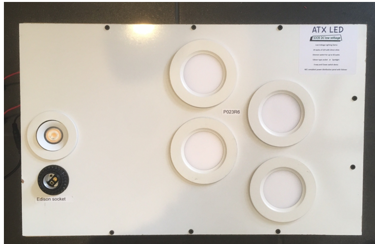
4 LEDs with 6 watts each